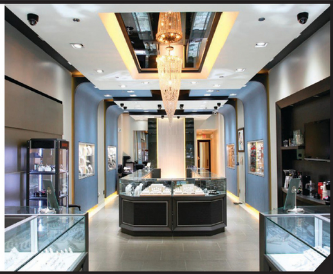
ON DISPLAY The Mon Ami Jewelry store, a DW project in the Loop.